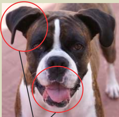
Don't forget to check inside the ears and mouth!