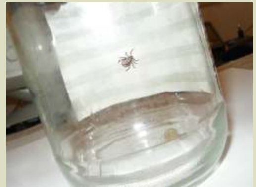
Bring in the tick for identification