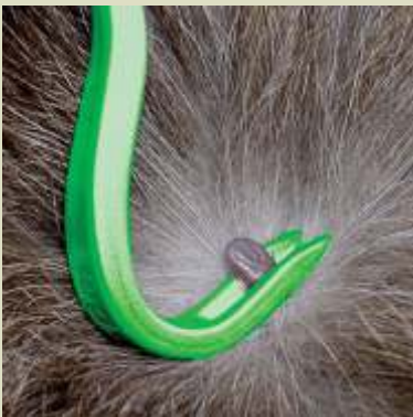
Tick tweezers (available at the clinic)

So the most important thing to remember is that after removal of the tick, please keep your pet quiet and watch for potential signs for the next 2 days. If you notice any signs developing (next page), contact us immediately for advice.