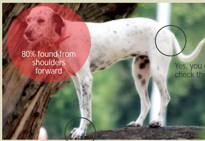
Don't forget to check in between the toes.

Around 80% of ticks are found between the shoulders forward toward your dog or cats nose, so check this area thoroughly every day. While we find 80% of ticks forward of the shoulders, ticks can be anywhere and have even been found inside the anus (bottom).