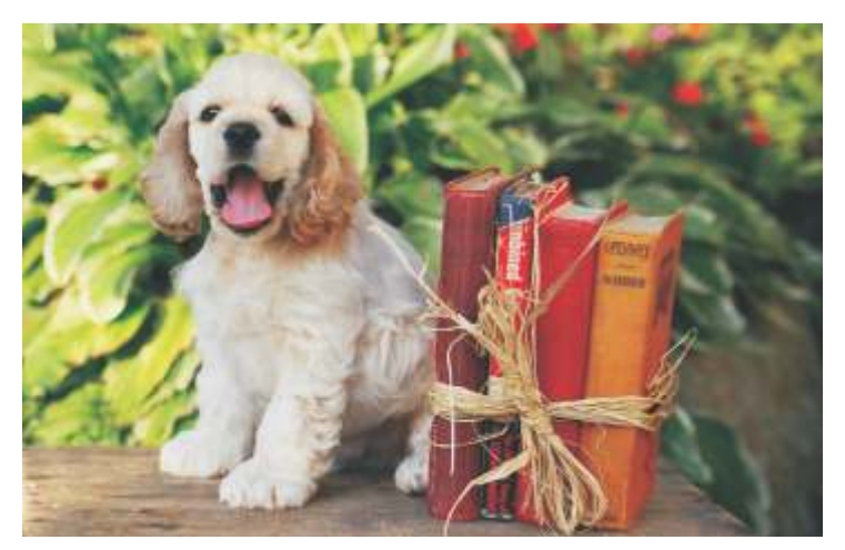
Enroll your pup into a class immediately!

Did you know that your puppy started to learn from the age of two weeks? What this means is by the time you get your puppy home he or she may have already developed some bad habits.