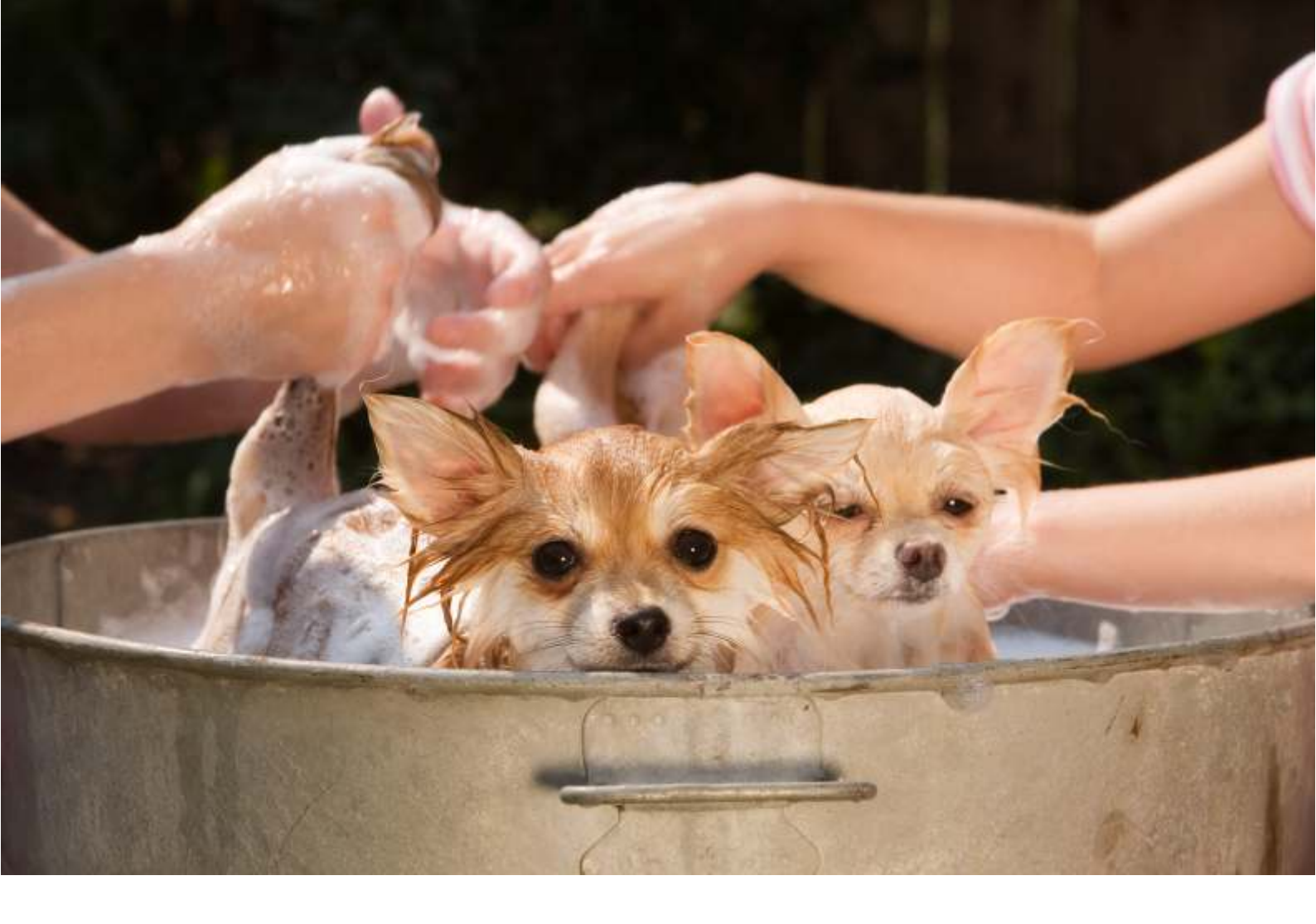
"Clean and dry your pets ears after a bath or a swim"