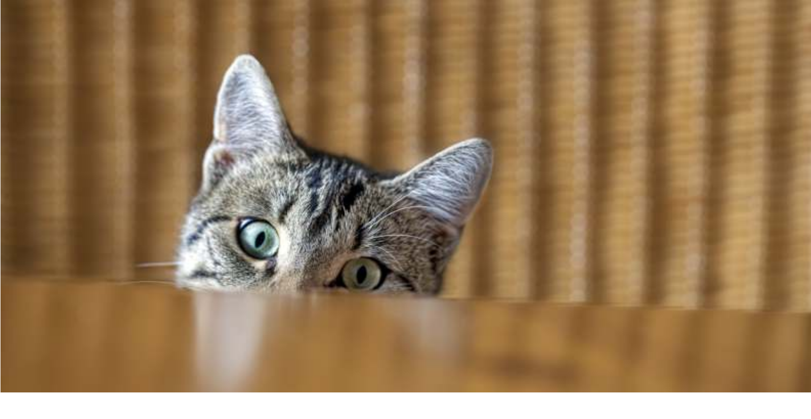
Let's address a few myths about desexing