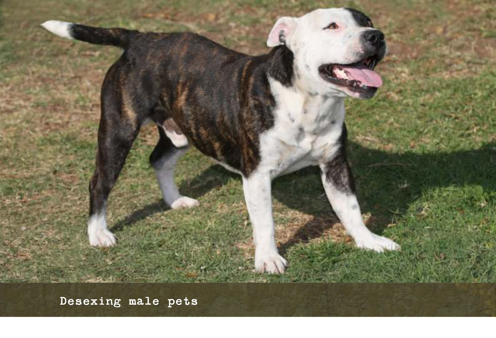
"Entire males are more likely to contract cancer of the reproductive tract"